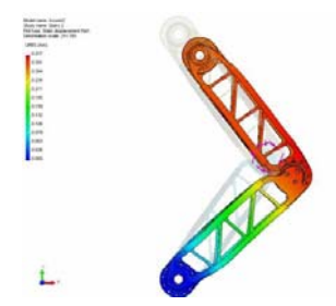
Fig. 3. Example of FEM simulation to validate the stiffness of the legs.

This selection has some marginal withdraws: first of all, the robot needs extra cabling (because of the hall sensor integrated in the motors) and a more complicated control and driving electronic.