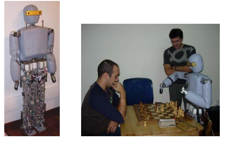
Fig. 1. Two images of Arabot, the first standing (left) and the second performing autonomously chess playing against a human (right).

In this section, the preliminary specifications of the robot are introduced; in the development phase we used the best components available today, in terms of motors, reducers and embedded computers.